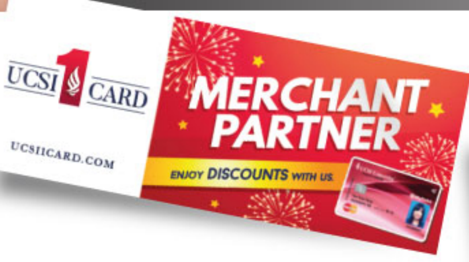
Stickers for our participating Merchant Partner